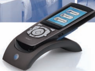
NevoS70 Universal remote