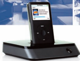
iPort FS-2 Series Free-standing systems for the iPod